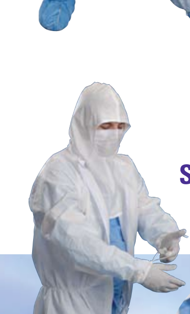
Step 12: Slip thumbs through thumb loops