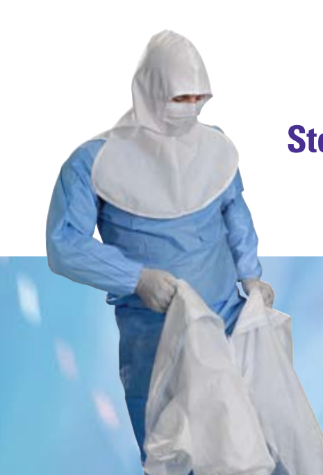
Step 8: Put one leg in and point toe through opening until snap releases