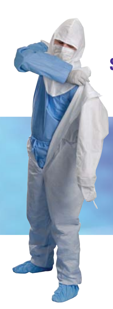
Step 10: Insert one arm and extend until snap releases