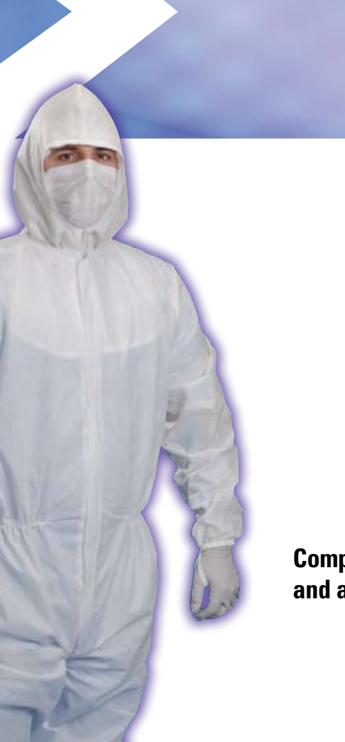
Complete gowning by adding goggles and a second pair of sterile gloves.