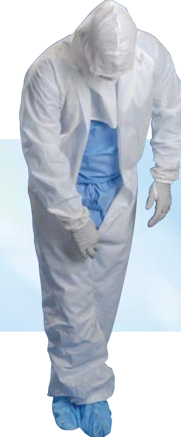
Final Step: Cross legs and zip up coverall