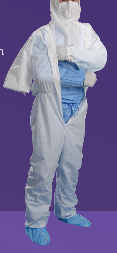
Step 12 Slip thumbs through