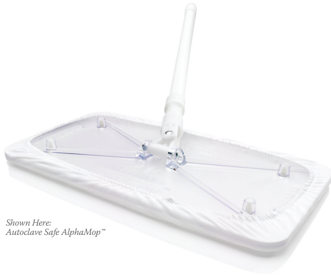
Shown Here: Autoclave Safe AlphaMop™