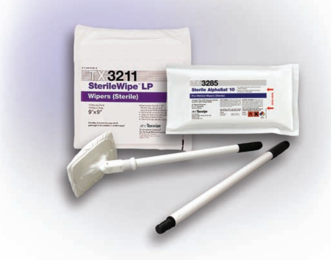
For more information about our sterile wipers, see the sterile product line brochure or visit www.texwipe.com

Sterile AlphaSat® 10 with 70% IPA - TX3285 SterileWipe™ LP - TX3211 Information packet